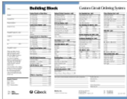
Custom Circuit System Business Form