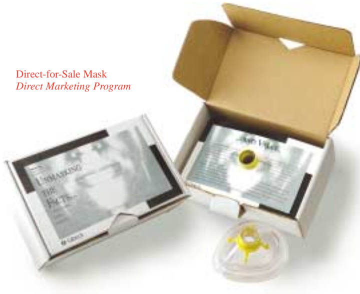
Direct-for-Sale Mask Direct Marketing Program