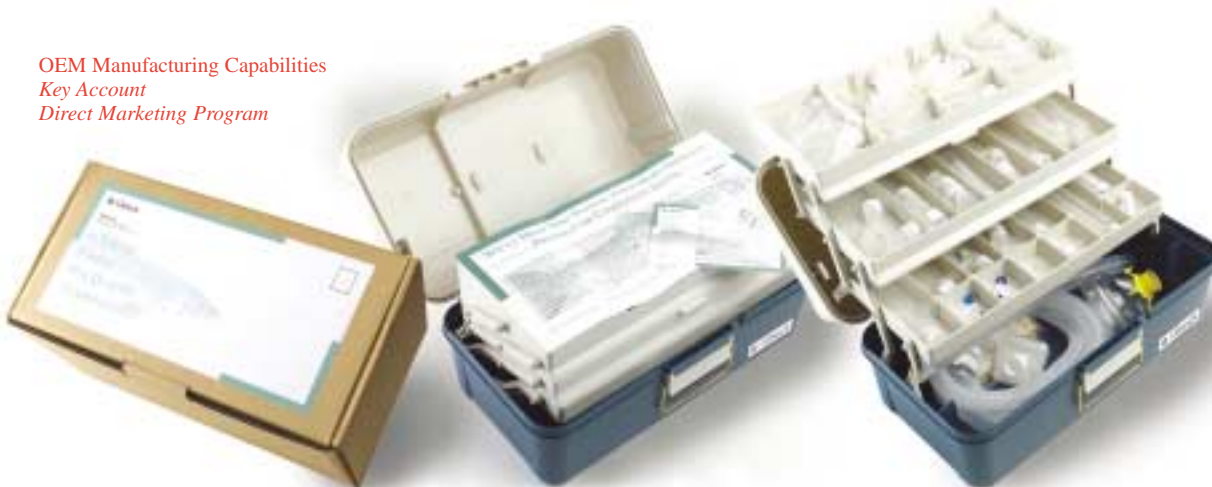
OEM Manufacturing Capabilities Key Account Direct Marketing Program

tion schedules and program costs. As a portion of the overall campaign, a parallel program promoting stock items manufactured as OEM and private label products was created to augment manufacturing production scheduling.