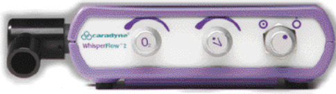
WhisperFlow 2 Variable Flow and O 2 Output

WhisperFlow 2 is a fully integrated CPAP solution. This generator combines traditional high performance with added features to improve ease of use.