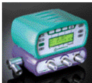
WhisperFlow 2 and Criterion Monitor create an integrated CPAP treatment system